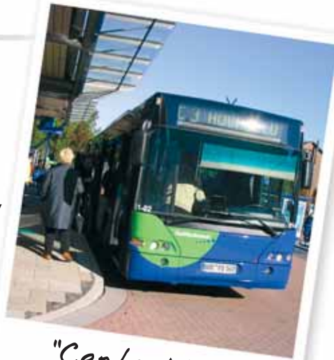
"Central bus station"

Irrespective of where you start from, you can reach Bocholt from all points of the compass in the shortest time. By car you can arrive via the A3 motorway (the Holland Line), via the B67 trunk road (from the direction of Münster), via the B473 main road (from the direction of Wesel). The local train – “the Bocholter”- ensures a rail link between the town and neighbouring regions and regional bus routes guarantee that you can get to Bocholt comfortably by means of public passenger transport services.