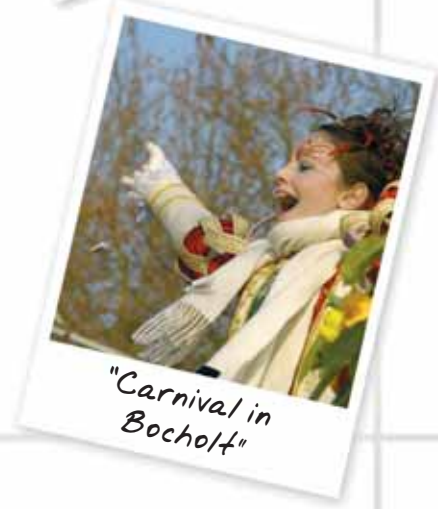
"Carnival in Bocholt"