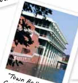
"Town Hall and Cultural Centre"