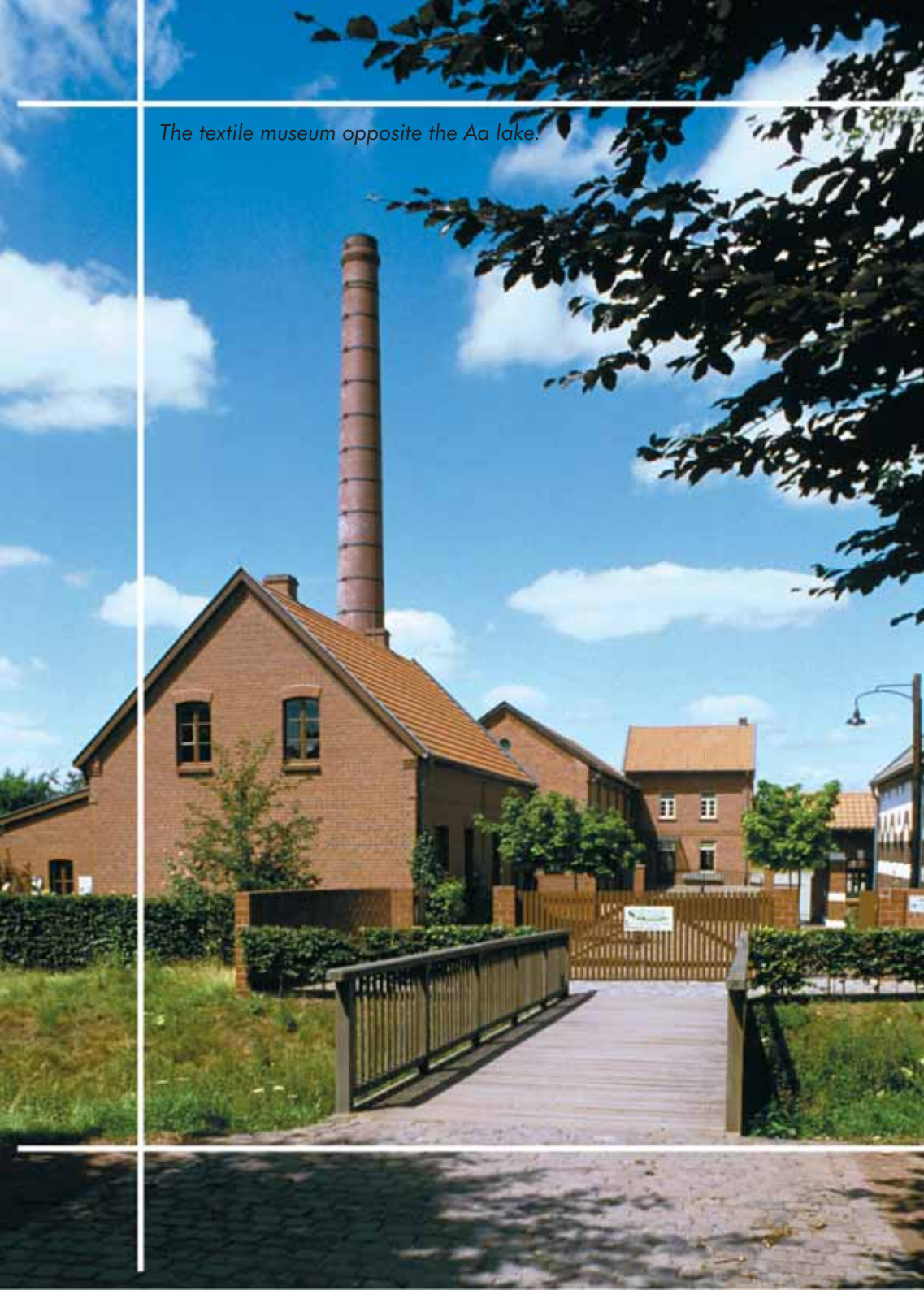
The textile museum opposite the Aa lake.