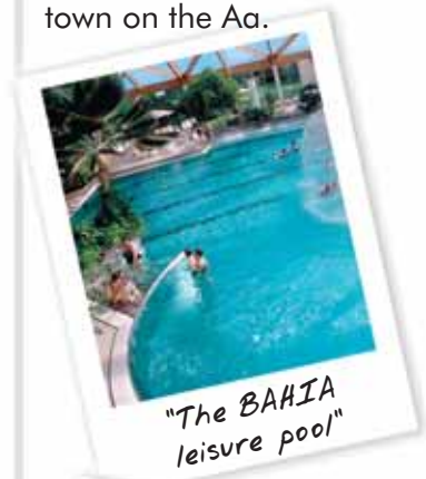
"The BAHIA leisure pool"