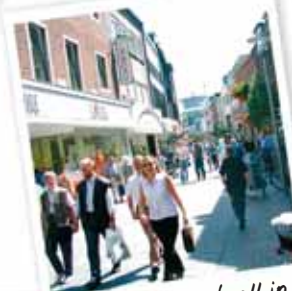
"A shopping stroll in the town centre"