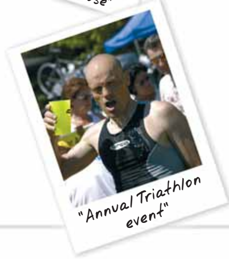
"Annual Triathlon event"