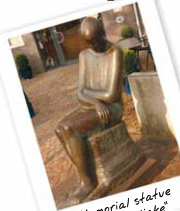
"Memorial statue at Südbrücke"