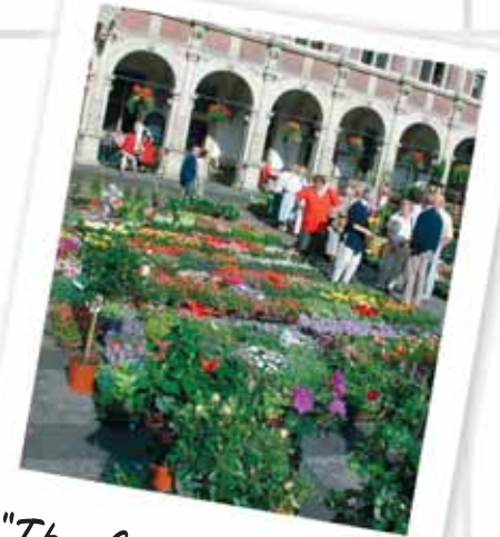
"The flower market"

Longing to shop? Then off to Bocholt. Beside two new shopping centres, the shopping arcades and the "Neutor" locality, the friendly town centre of Bocholt invites you to make an extensive shopping spree. In the shop-filled streets around the historic town hall quality and customer service are still trump cards. Here you can indulge yourself in a buying orgy to your heart's content and at the same time also enjoy the unique flair of Bocholt city centre.