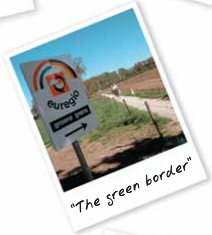
"The green border"