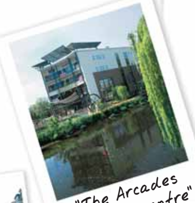
"The Arcades shopping centre"