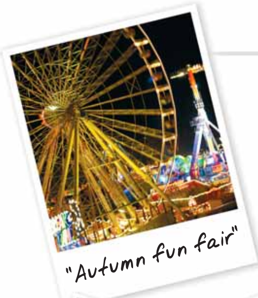
"Autumn fun fair"