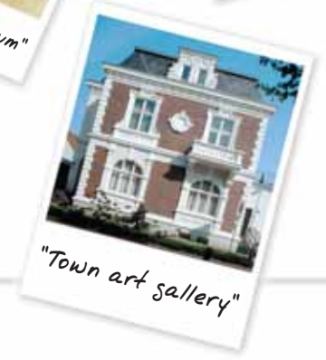
"Town art gallery"