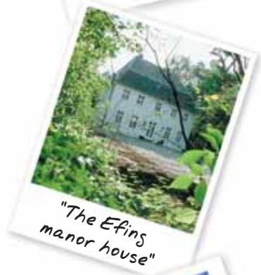
"The Efins manor house"