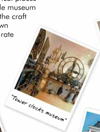
"Tower clocks museum"