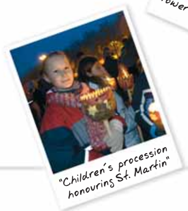
"Children's procession honouring St. Martin"