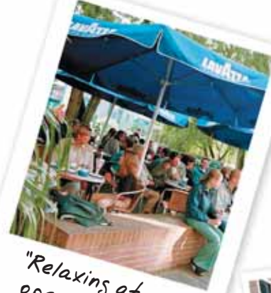
"Relaxing at an open-air cafe"