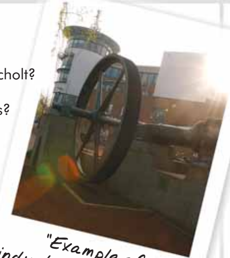
"Example of industrial archaeology"