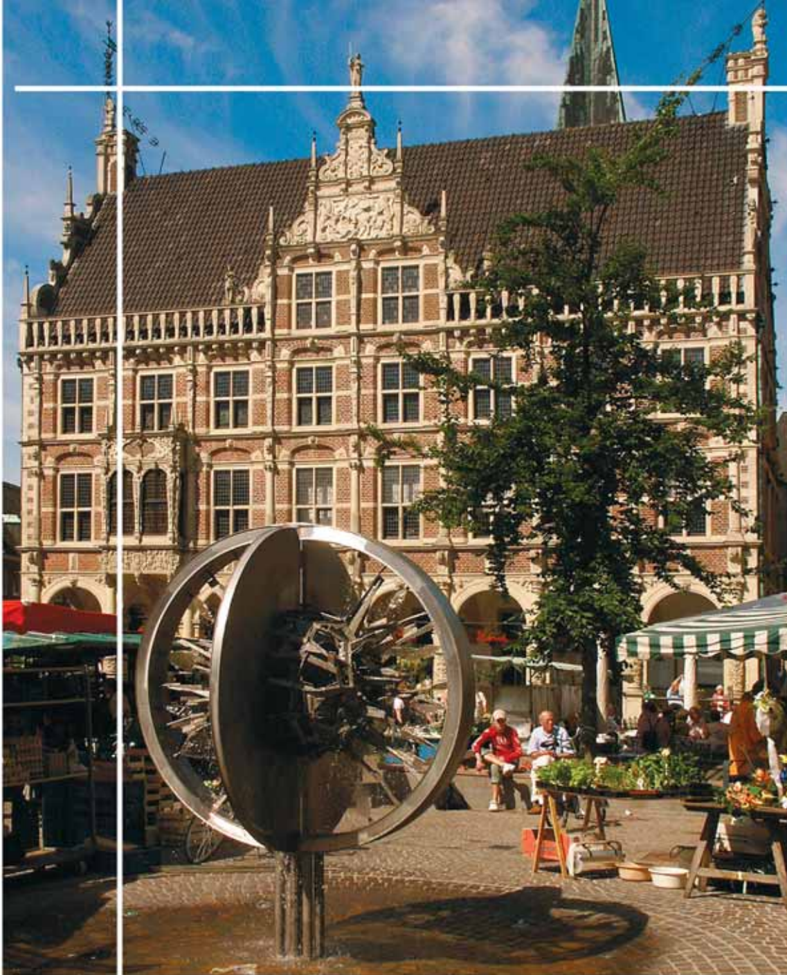
The historic Town Hall (1618 - 1624)